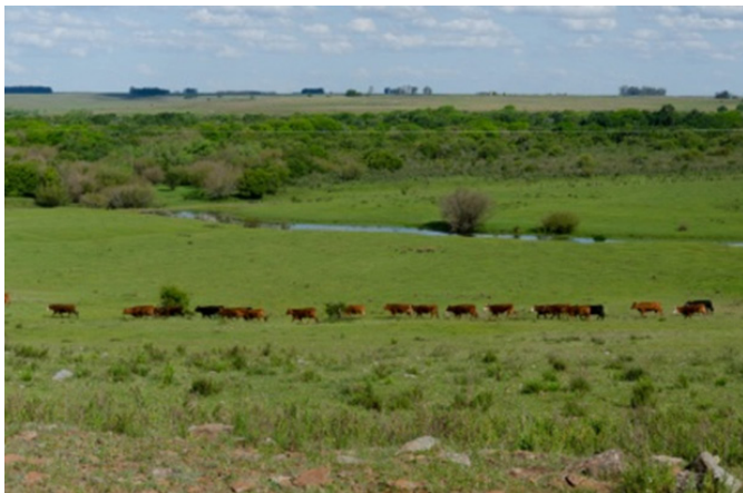
Figure 1: Livestock farming landscape.

objective of fortifying food sovereignty and security, contributing to environmental care, generating benefits that improve inhabitants' life quality (Law n°19717). Regarding livestock, natural pastures occupy more than 70% of the total exploited area in Uruguay; bovine livestock is the productive specialization of 50% of the country's agricultural holdings. If we consider ovine livestock, this increases to almost 60% of farms [6]. Family farming, according to official sources, is a significant social group in Uruguay: 36,965 family farmers in 21,657 holdings are mostly engaged in cattle and sheep production as the main economic activity [7]. Faced with the importance that agroecology is taking particularly in family farms, we wanted to explore how livestock farmers decide whether or not to implement more agroecological production systems, it means exploring innovation niches, according to the proposition of Geels [5]. For this purpose, in the northern region of Uruguay, where livestock activity from natural pastures predominates, we selected a sample of nine livestock farming families where we conducted studies cases (three interviews of more than 2 hours) according to the global farm approach methodology [8], in order to understand the situations, finalities (or objectives), management practices and strategies of the livestock farmers (Figure 1).