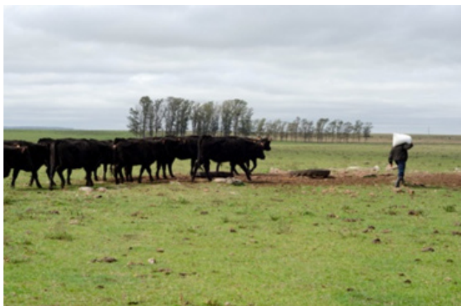
Figure 2: Farmers performing livestock production tasks.9247174128