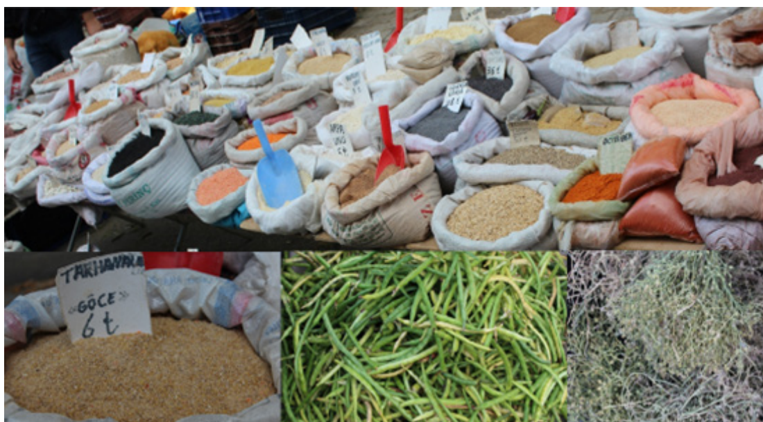
Figure 1: Herbal materials used in the production of tarhana and the sale of dried Tarhana in the public market (Isparta).