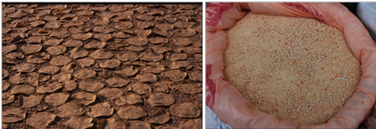
Figure 3: Sun drying of Tarhana in Eastern Anatolia (in left) and granulation by rubbing (in right).

An important part of Tarhana consists of strained yogurt and wheat. Yoghurt, wheat flour/Yarma, dried mint/thyme and red pepper, green fresh pepper, onion are chopped and grated and mixed. It is placed in a container, covered with a clean cloth and left for 7-10 days to ferment. The waiting time can be increased. The one that is left to ferment for a long time is called 'Sour Tarhana'. If the waiting period does not exceed one week, it is called 'Dessert Tarhana'. This fermented material is poured onto a clean cloth. It is dried outdoors in a shady, airy place (Figures 3-5).