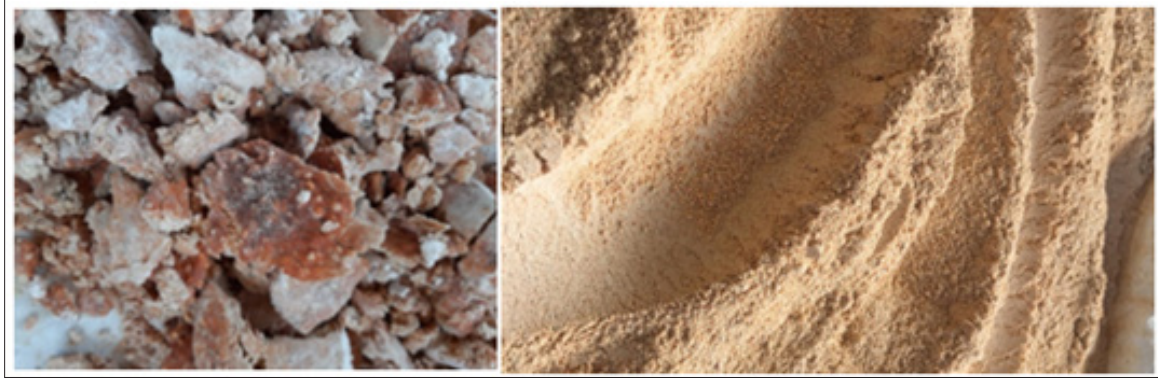
Figure 5: Göçe Tarhana prepared by the Taurus nomads (Afyonkarahisar).