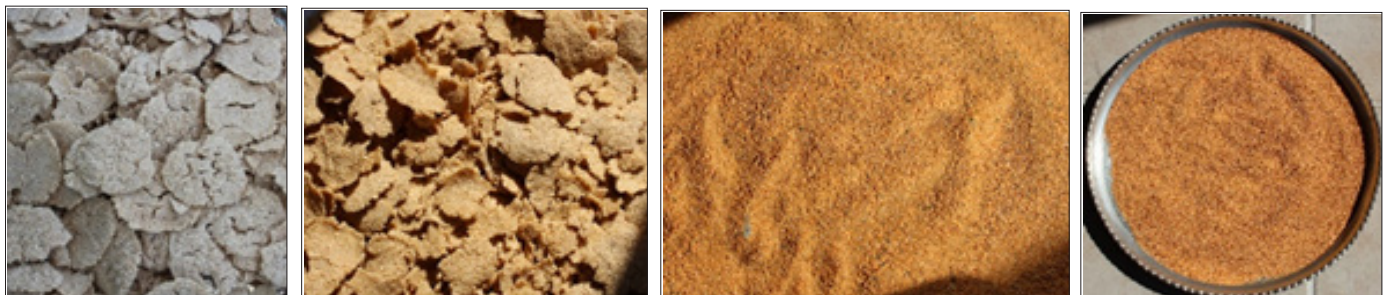
Figure 4: Koca (Tooth, Ball) Tarhana (in left) and Flour Tarhana (in right), prepared by the Taurus nomads.