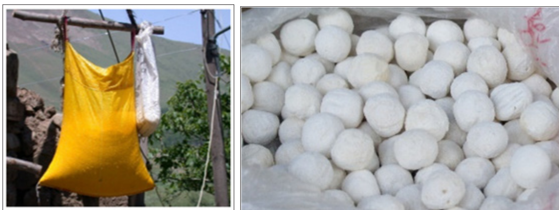
Figure 2: Preparation of Kurut, which is used instead of strained yogurt in the production of Tarhana (Van).

Tarhana; It is light in weight, has high nutritional value, keeps the stomach full, and is suitable for practical consumption. It is durable enough not to deteriorate in heat and cold. Due to these features, it became an important food of the Ottoman Army. The first known production in the palace was made by the mother of Yavuz Sultan Selim.