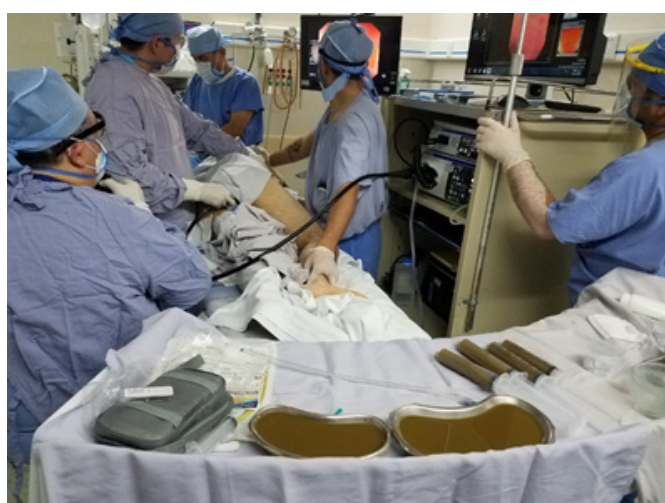
Figure 1: Intestinal microbiota transplantation.

History of IBS, IBD, diarrhea, or chronic constipation. Connective tissue diseases. Atopias (eczema, asthma, eosinophilic pathologies of the gastrointestinal system). History of gastrointestinal malignancy. Immunosuppressive drugs. Treatment against neoplasms. Obesity (BMI> 30), type 1 diabetes mellitus. Type 2 diabetes mellitus. Metabolic syndrome, fibromyalgia or chronic fatigue syndrome. AIDS, Hepatitis B and C virus infection or risk of transmission in the last 12 months. Have been in prison; use illicit drugs, be an individual at high sexual risk, have tattoos or piercings, have traveled in the last 6 months to endemic countries with diarrheal diseases or high risk of traveler’s diarrhea. Present with contagious disease or Creutzfeld-Jakob disease (Figure 1).